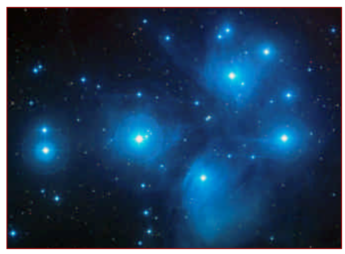
Figure 5 - The Pleiades

Elsewhere Lewis speaks of them as "journeying onward together through the immensity of space."