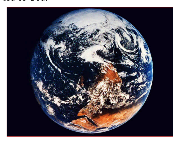
Figure 1 - NASA

Scripture was written. How did Job know this scientific fact? Only God could have revealed this to Job. The Old Testament prophets wrote as they were moved by the holy Spirit (2 Peter 1:21). The Judeo-Christian Bible is the inspired Word of God.