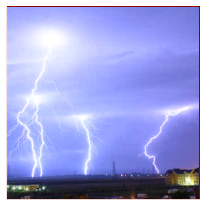
Figure 4 - Lightning in Romania

Our Bible also talks about rain, lightning and storms. But it contains none of these superstitious ideas found in the other so- called scriptures. The Judeo-Christian Bible taught that earth's weather followed rules and cycles. Genesis 8:22. "While the earth remaineth, seed time and harvest, and cold and heat, and summer and winter, and day and night shall not cease."