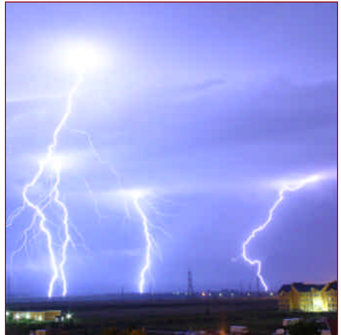
Figure 4 - Lightning in Romania

Our Bible also talks about rain, lightning and storms. But it contains none of these superstitious ideas found in the other so- called scriptures. The Judeo-Christian Bible taught that earth’s weather followed rules and cycles. Genesis 8:22. “While the earth remaineth, seed time and harvest, and cold and heat, and summer and winter, and day and night shall not cease.”