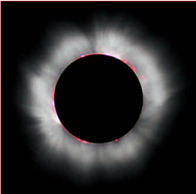
Figure 2 - Solar Eclipse

Eclipses are an example of what people feared. An eclipse happens when the sun's light is blocked by the earth or moon. The moon is bright because it reflects the sun's light. But when the earth blocks that light, the moon looks like it is disappearing. Also, when the moon comes between the earth and the sun, it looks like the sun is disappearing.