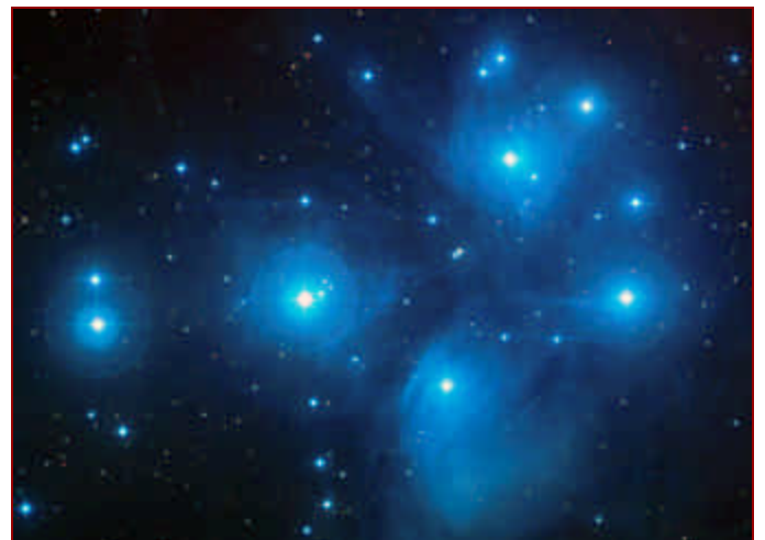
Figure 5 - The Pleiades

Elsewhere Lewis speaks of them as “journeying onward together through the immensity of space.”